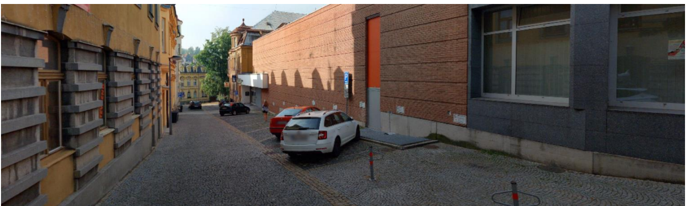
Continuation of Jiráskova Street. The place where some of the models will be unloaded according to the organizer's instructions. Jiráskova Street is one-way.