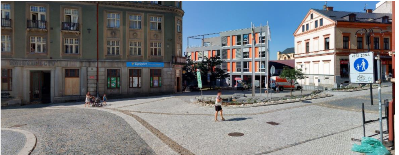
Exit to Jiráskova Street from Jungmannova Street.